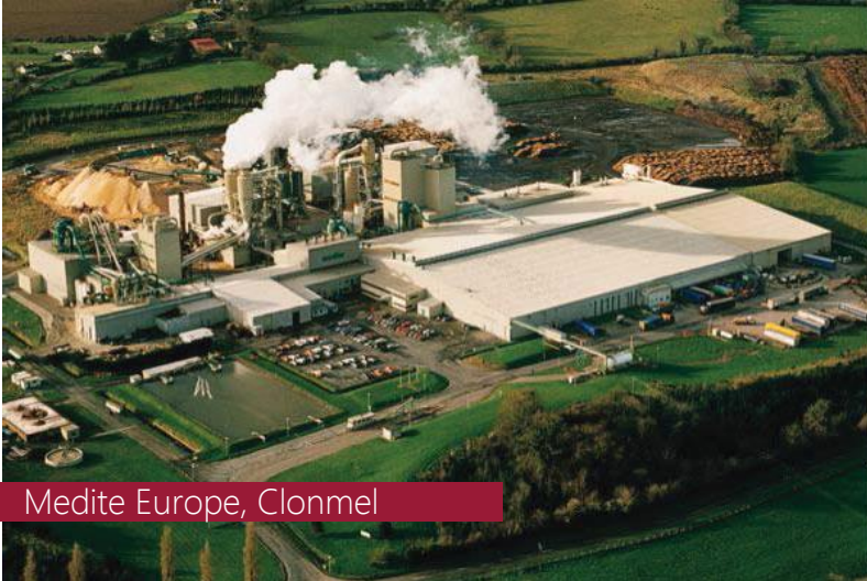
Medite Europe, Clonmel