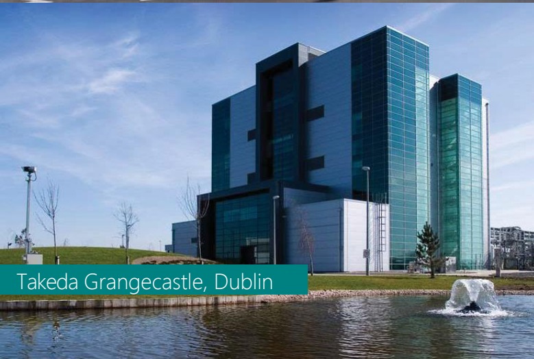
Takeda Grangecastle, Dublin