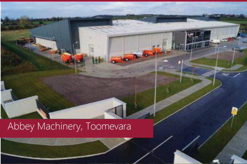
Abbey Machinery, Toomevara