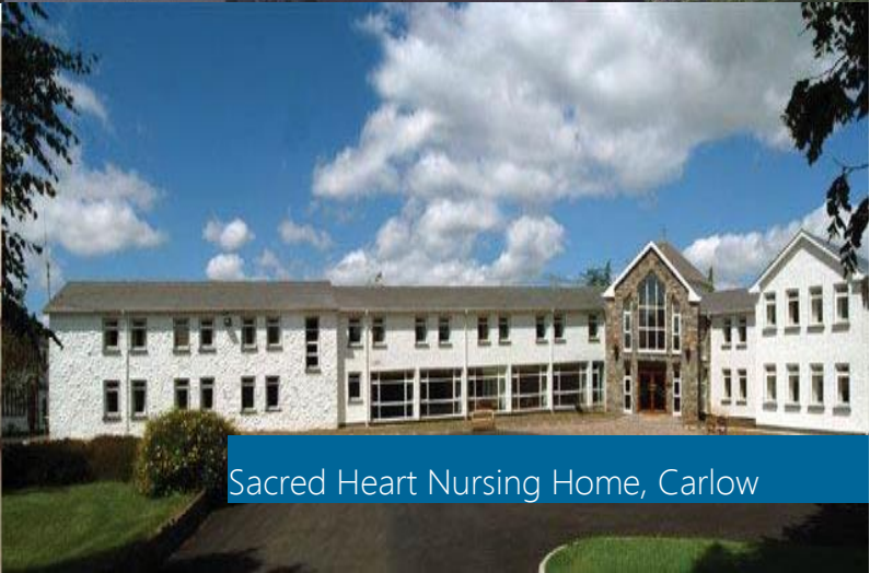
Sacred Heart Nursing Home, Carlow