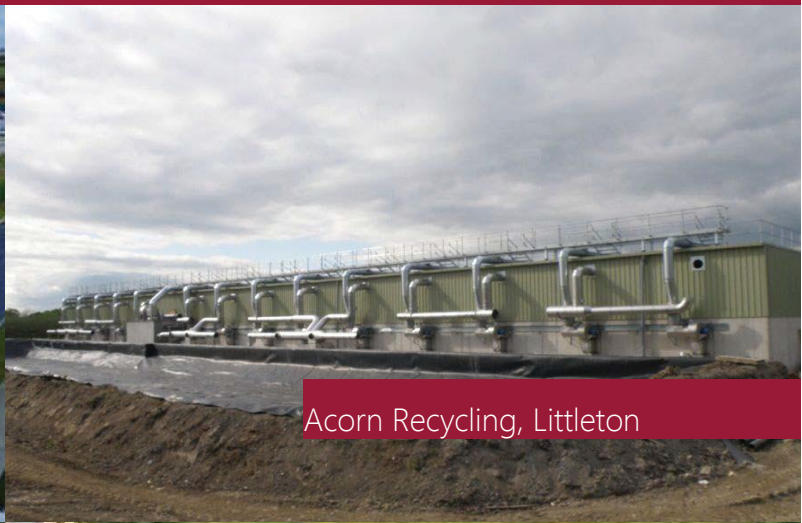
Acorn Recycling, Littleton