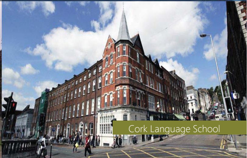
Cork Language School