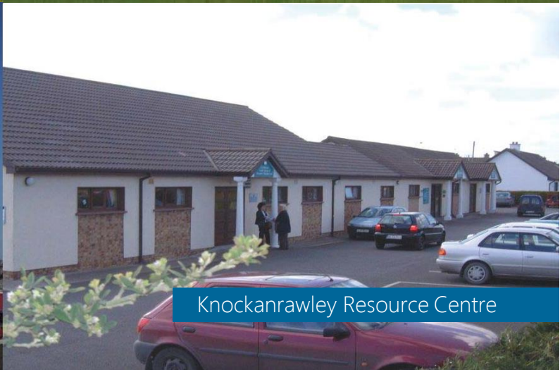
Knockanrawley Resource Centre