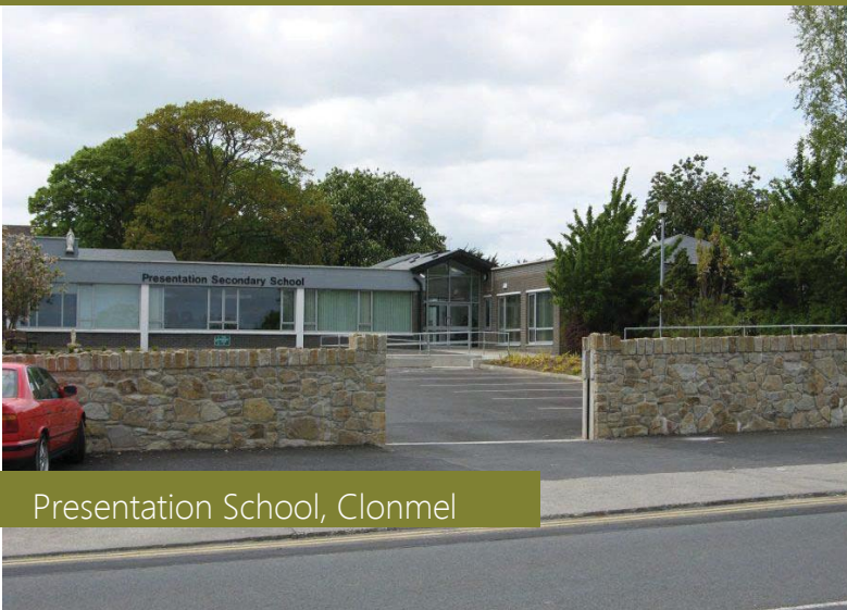
Presentation School, Clonmel