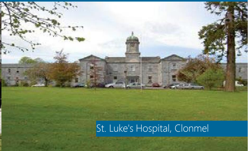
St. Luke's Hospital, Clonmel