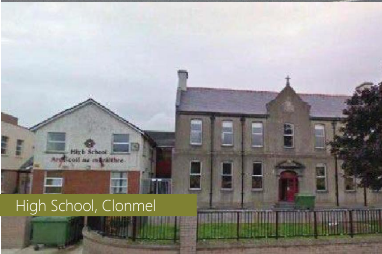
High School, Clonmel