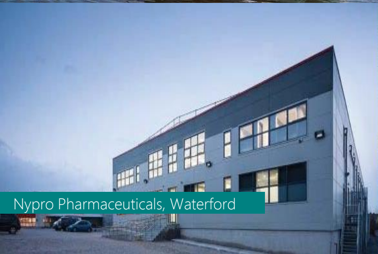
Nypro Pharmaceuticals, Waterford