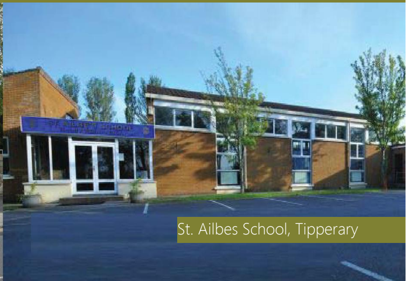
St. Ailbes School, Tipperary