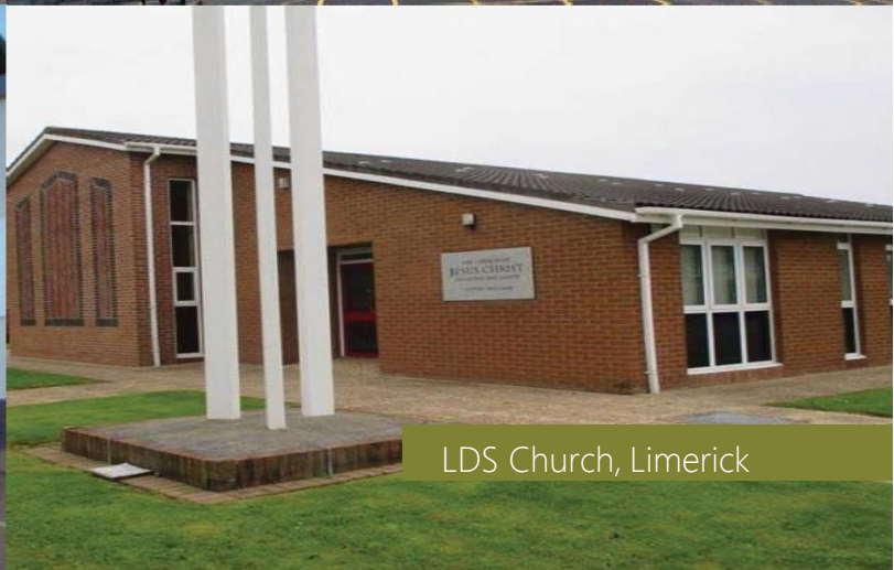
LDS Church, Limerick