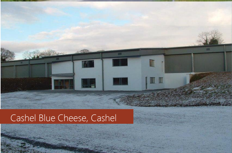
Cashel Blue Cheese, Cashel