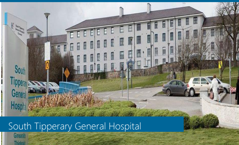
South Tipperary General Hospital