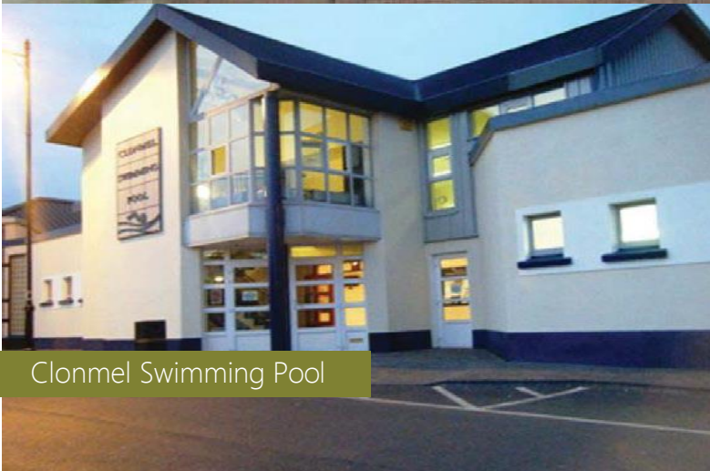
Clonmel Swimming Pool